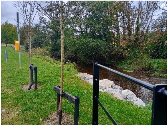
Midleton to Youghal Greenway, County Cork