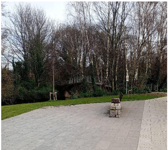
Dodder Greenway, County Dublin