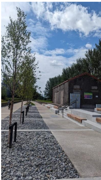
Midleton to Youghal Greenway, County Cork

Some images are provided on pages 2 and 3 for demonstrative purposes.