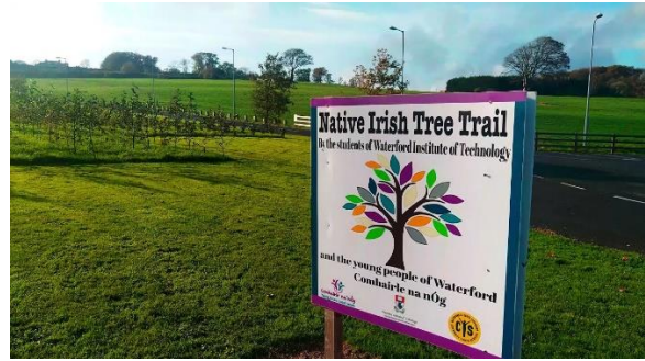
Tree Trail - WIT, County Waterford