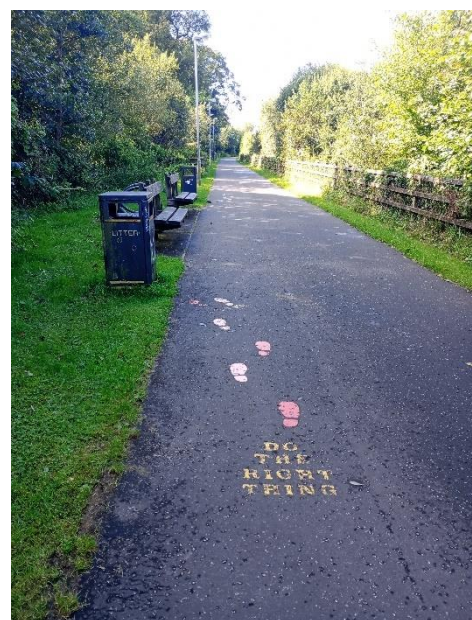
Strathfoyle Greenway, County Derry