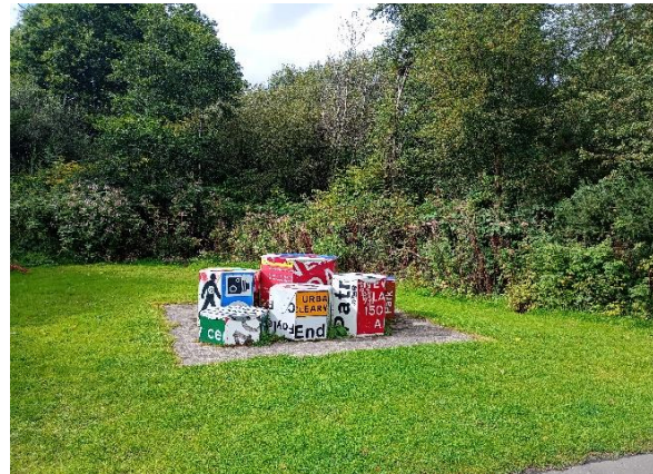
Strathfoyle Greenway, County Derry