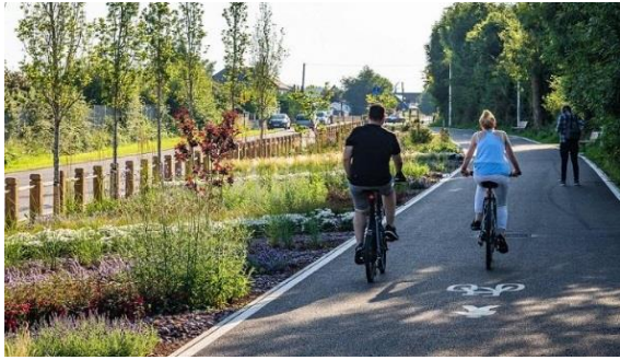
Glouthane, County Cork